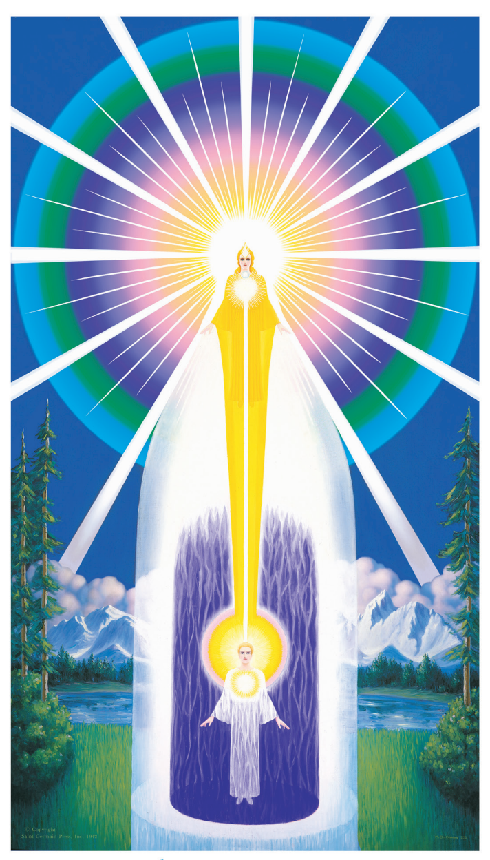
The Magic Presence