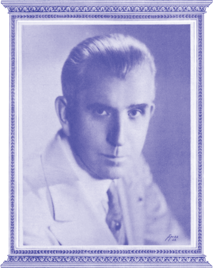
The Accredited Messenger Guy W. Ballard