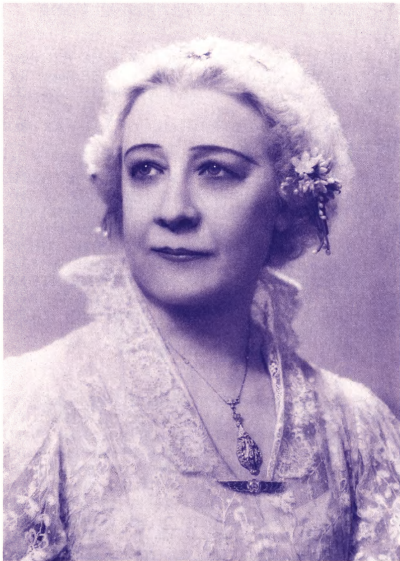
LOTUS, OUR LOVED ONE ASCENDED