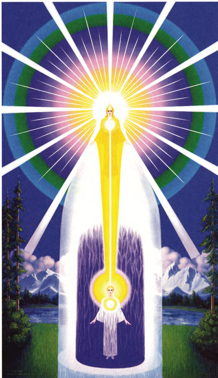
The Magic Presence™