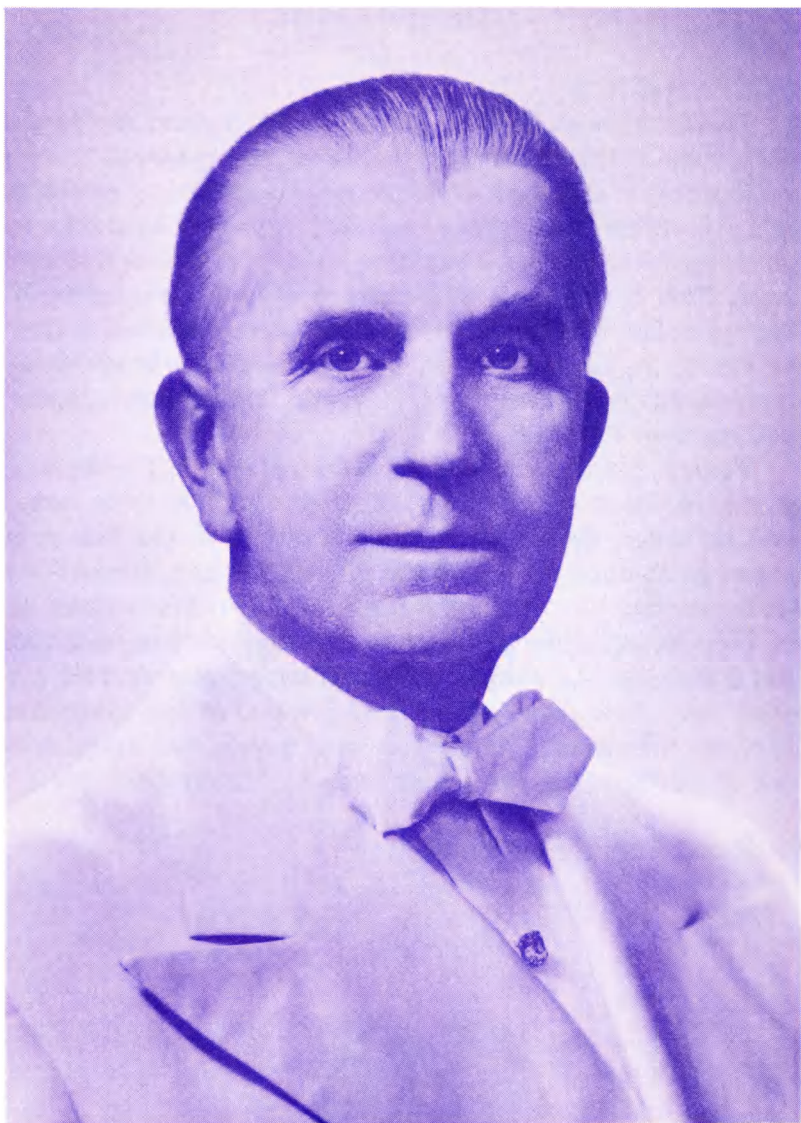
GODFRE, OUR LOVED ONE ASCENDED