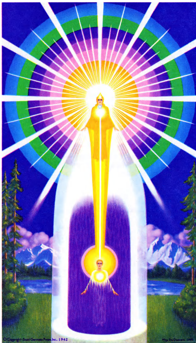
The Magic Presence