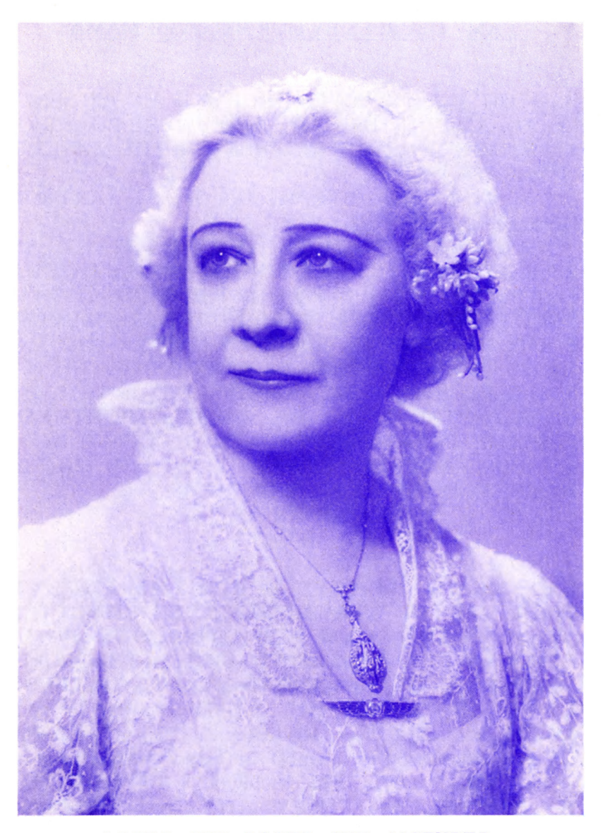
LOTUS, OUR LOVED ONE ASCENDED