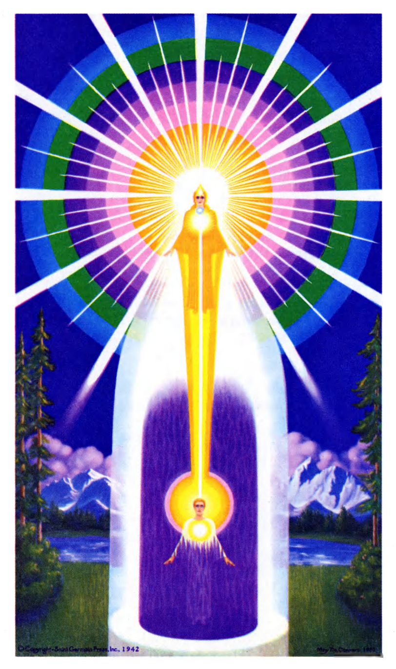
The Magic Presence