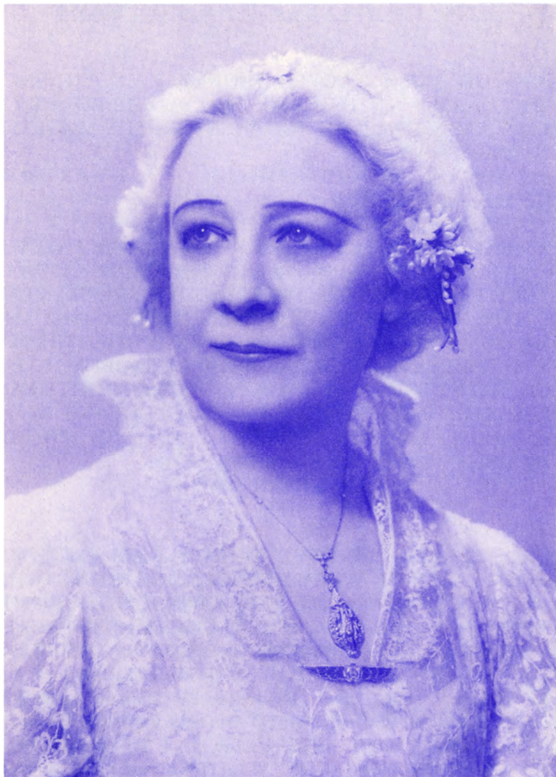
LOTUS, OUR LOVED ONE ASCENDED