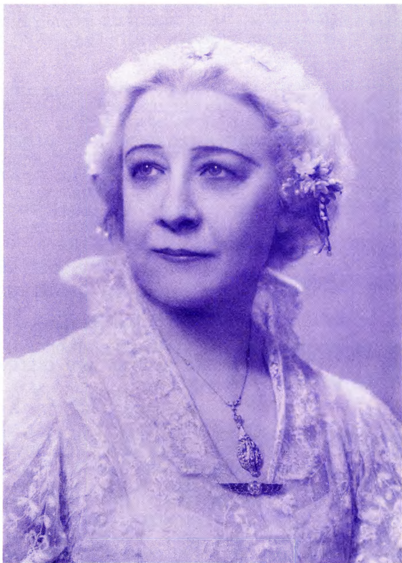
LOTUS, OUR LOVED ONE ASCENDED