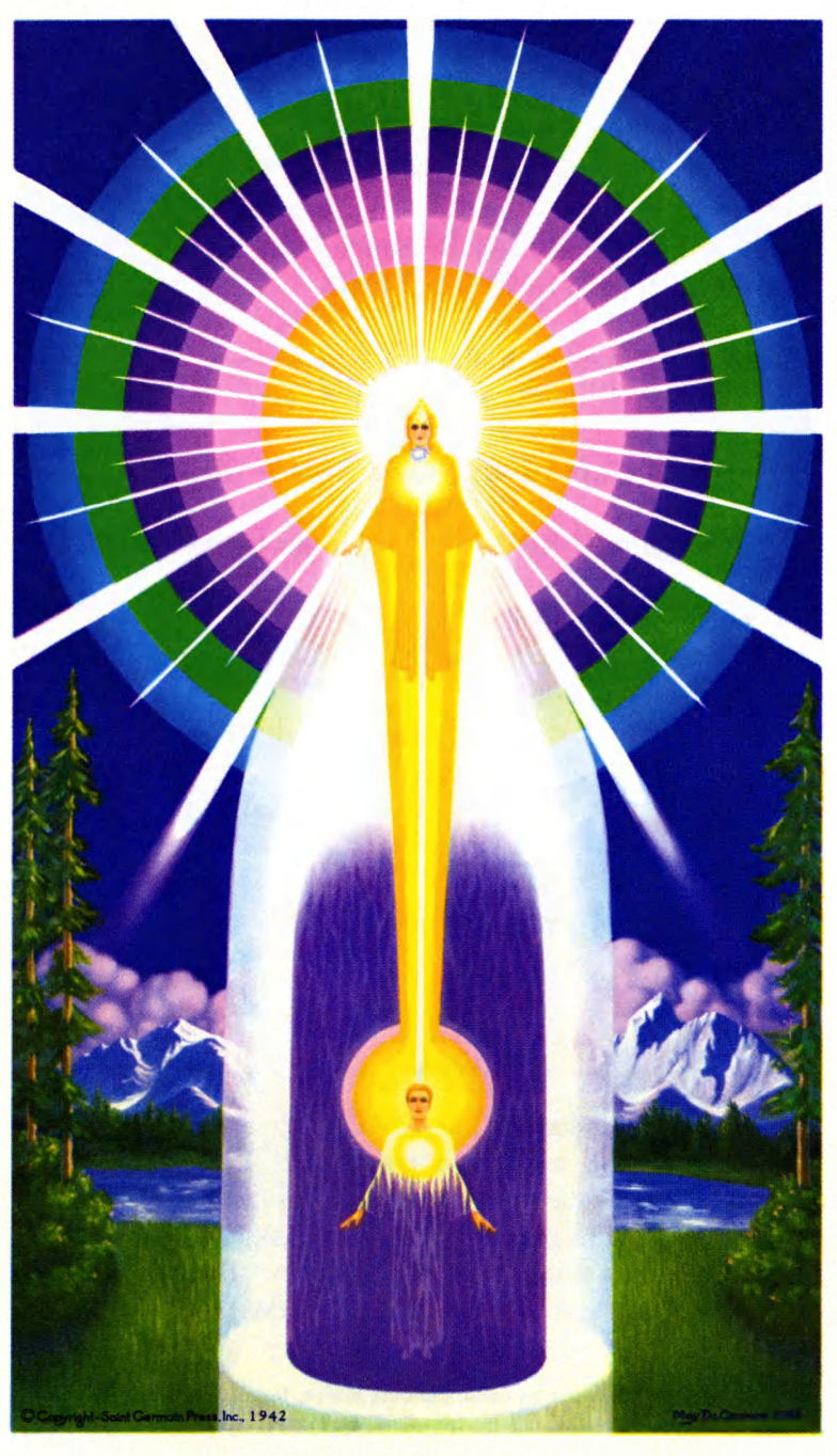
The Magic Presence