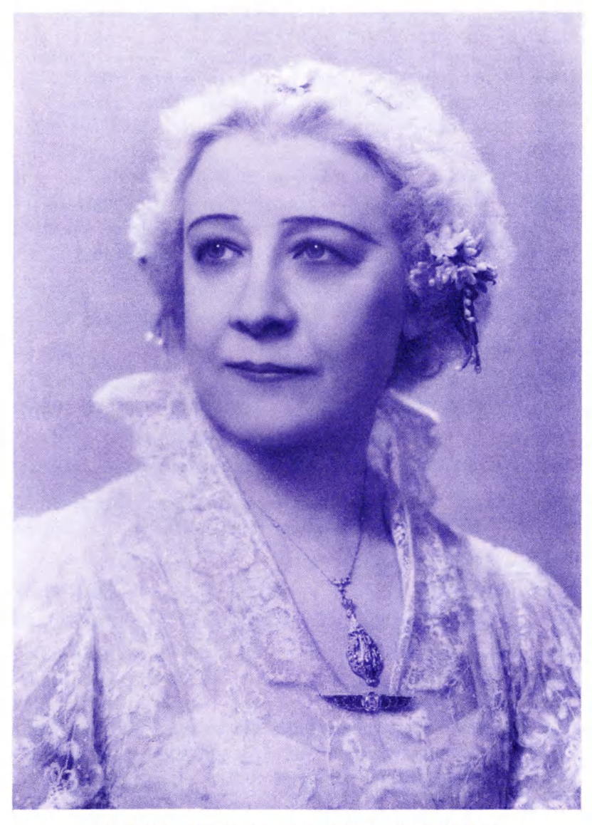
LOTUS, OUR LOVED ONE ASCENDED