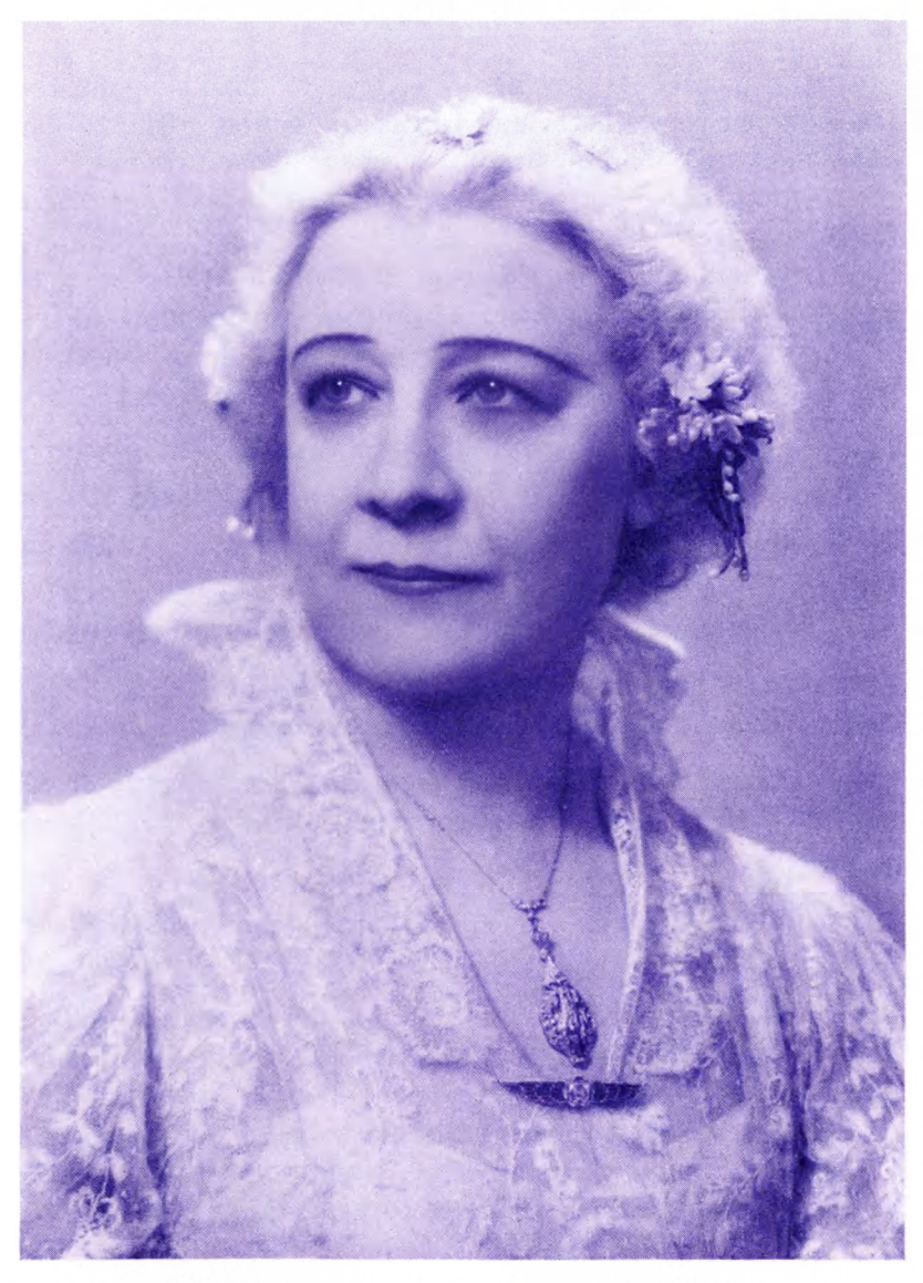
LOTUS, OUR LOVED ONE ASCENDED