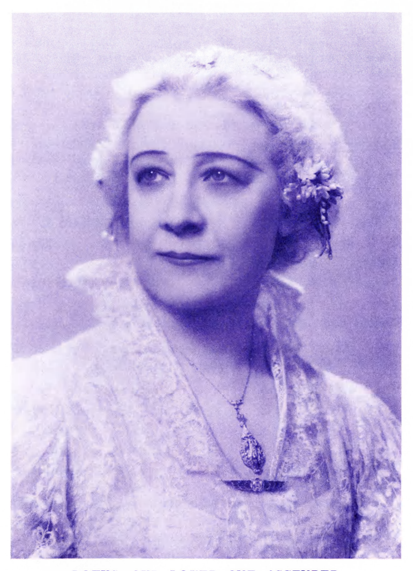
LOTUS, OUR LOVED ONE ASCENDED