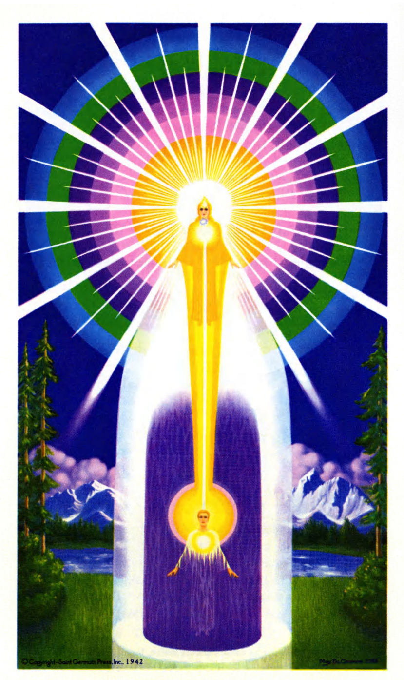
The Magic Presence