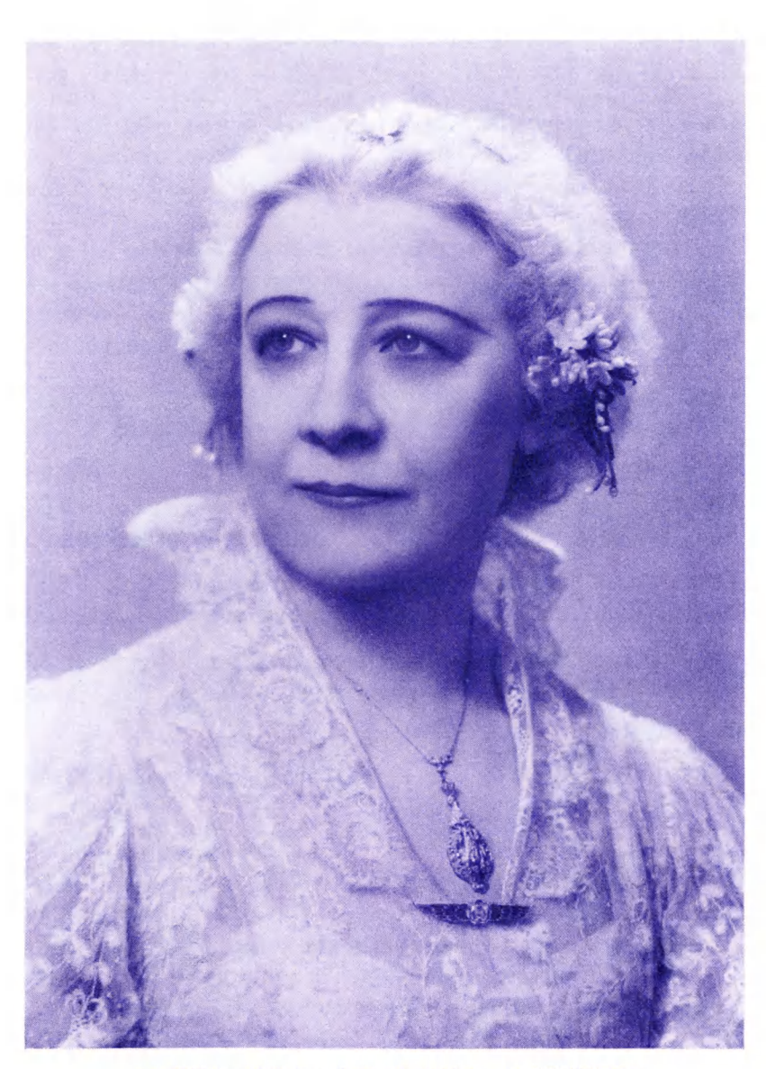
LOTUS, OUR LOVED ONE ASCENDED