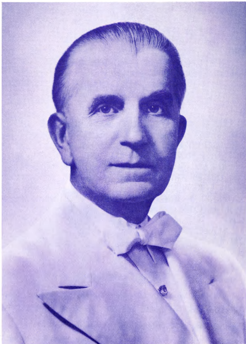
GODFRE, OUR LOVED ONE ASCENDED