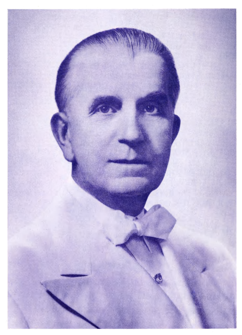
GODFRE, OUR LOVED ONE ASCENDED