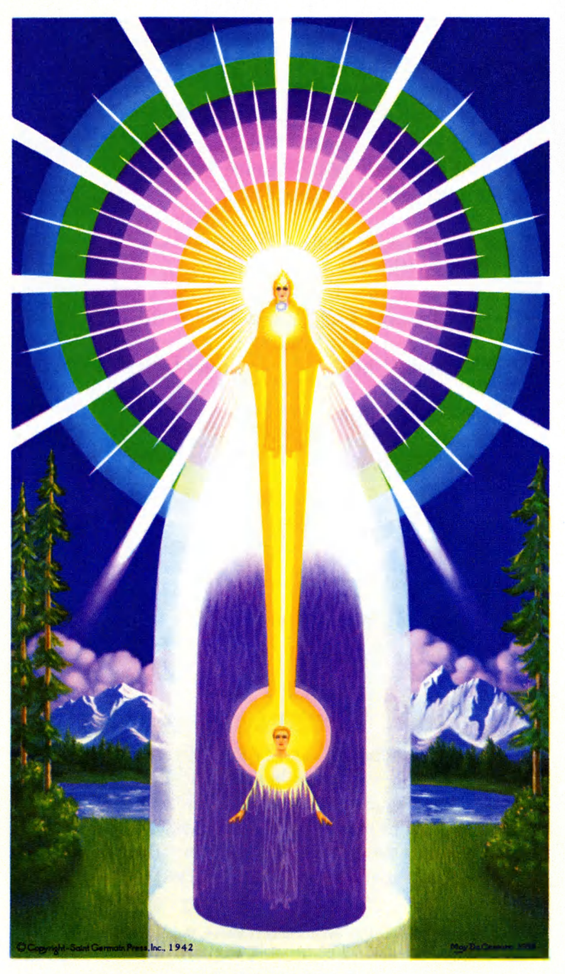
The Magic Presence