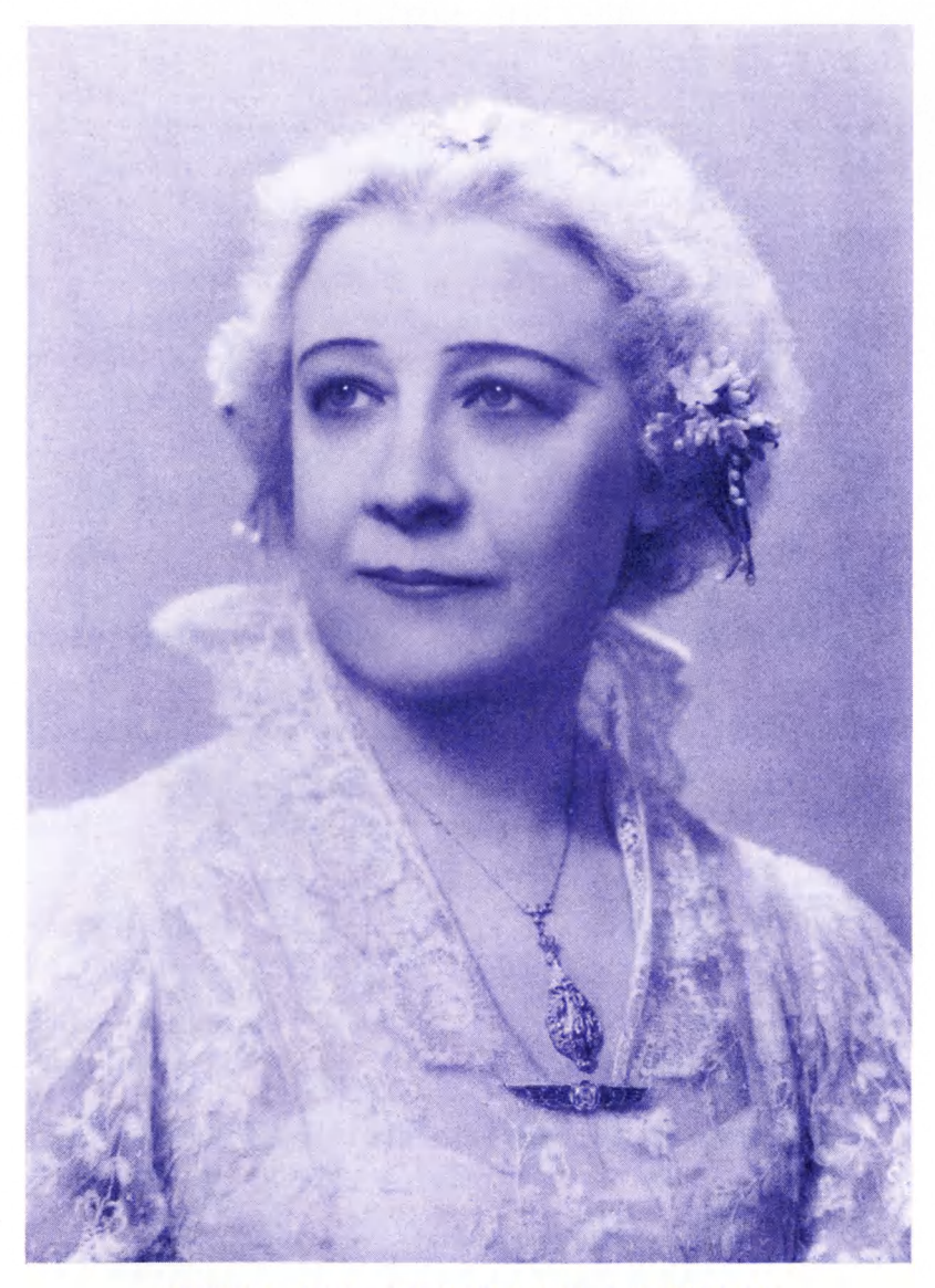
LOTUS, OUR LOVED ONE ASCENDED