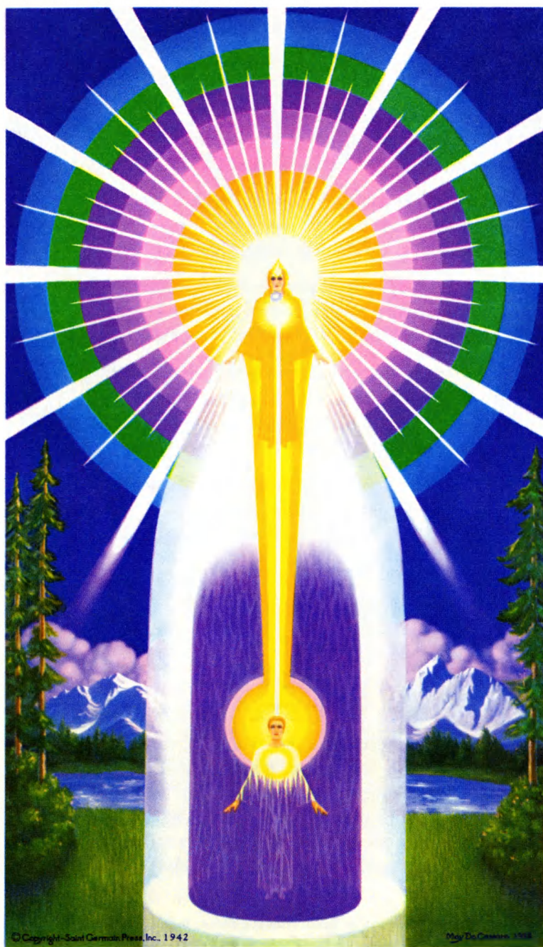
The Magic Presence