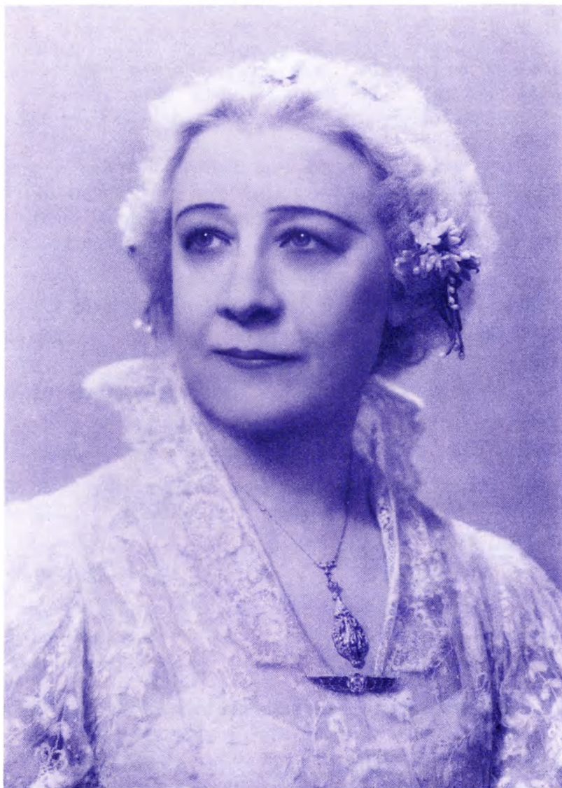
LOTUS, OUR LOVED ONE ASCENDED