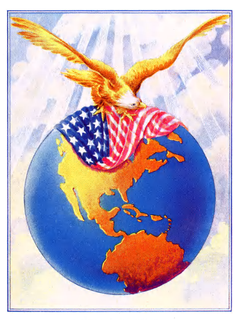
· MY AMERICA ·

"I AM" the Light of America whose "Cup" shall quench the thirst of all mankind, when they are obedient to My Light!